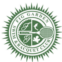
FIG GARDEN SWIM & RACQUET CLUB

4722 North Maroa • Fresno, California 93704-3207